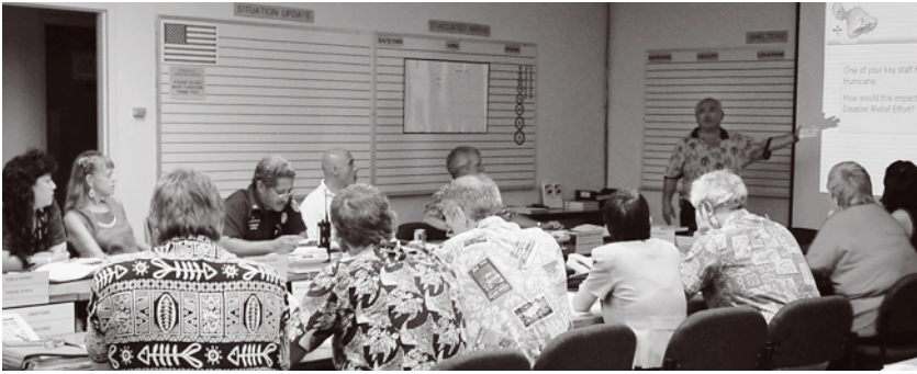
PDC supports disaster-response volunteers at the Maui County Emergency Operations Center.