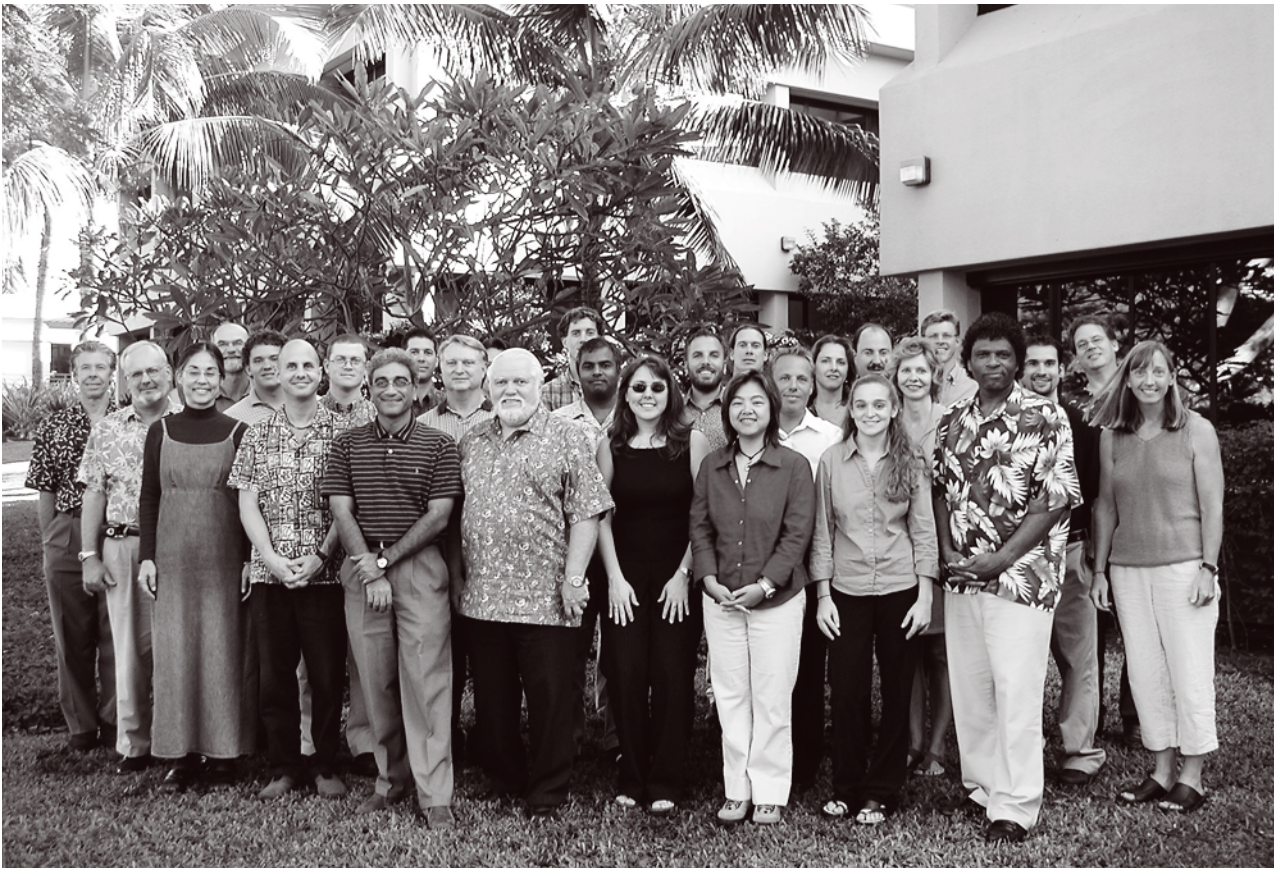
The PDC team in Kihei, Maui.

n Participated with the East-West Center on the Leadership Seminar for Pacific Island Disaster Managers , attended by executives from 17 Pacific Island nations and states. PDC also worked with the South Pacific Applied Geoscience Commission (SOPAC) on a joint initiative to implement a risk reduction framework for governments of small island developing states in the Pacific Islands.